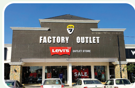
NH-7 FACTORY OUTLET (600 MTR.)