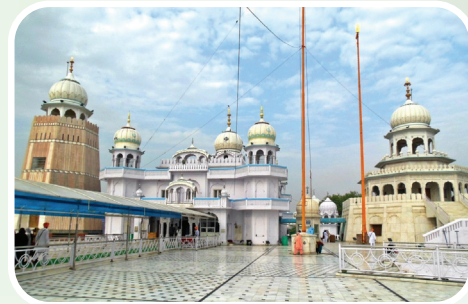
TAKHAT SRI DAMDAMA SAHIB (26 KM)