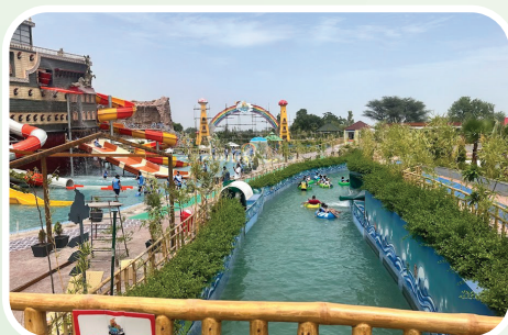
PUNJOY WATERPARK (7 KM)