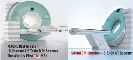
MAGNETOM Avanto - 18 Channel 1.5 Tesla MRI Scanner. The World's First Tim MRI

ADESH ADVANCED IMAGING INSTITUTE (A UNIT OF ADESH INSTITUTE OF MEDICAL SCIENCES & RESEARCH) Brand New 1st time in Malwa State of Art